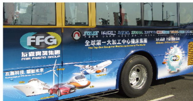
TIMTOS 2013 – Bus Advertising