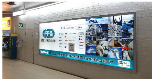
EMO 2013 - Airport Advertising