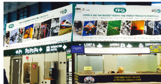
EMO 2015 - Airport Advertising