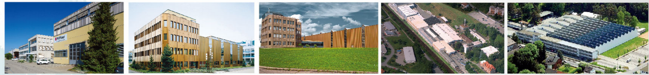
● Pfiffner - Switzerland ● Pfiffner - Switzerland ● Pfiffner - Germany ● Hüller Hille - Germany ● Hessapp - Germany