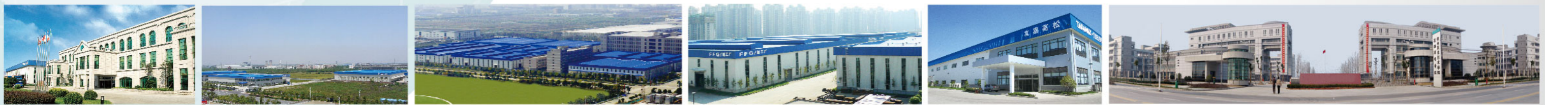
● Good Friend China Headquarters – Hangzhou ● Glory Friend / ANEST IWATA – Jiangdong ● Hangzhou Good Friend – Xiasha Technology Park (231,000 m²) ● Hangzhou Leadwell – Xiasha (66,000 m²) ● Hangzhou Takamaz - Jiangdong ● FFG Institute of Electromechanics (2,300 students) – Xiasha (462,000 m²)