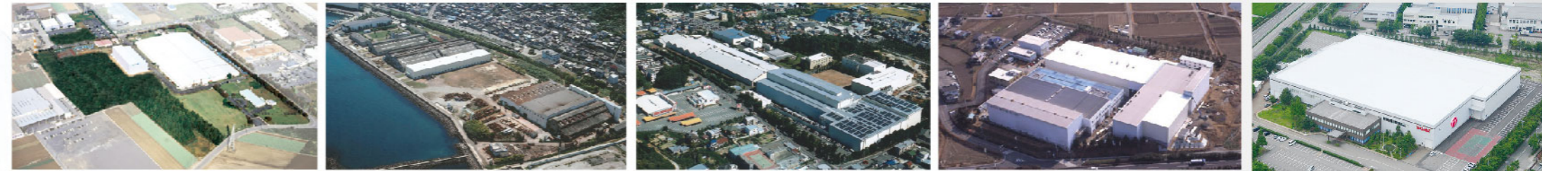
● Ikegai Corporation - Japan Land 133,000㎡/ Plant 65,000㎡ ● SNK – Japan(Hiroshima Plant) Land 133,000㎡/ Plant 121,000㎡ ● SNK-Japan(Shinodayama Plant) Land 210,000㎡/ Plant 205,000㎡ ● NISSIN-Japan ● F.T. Japan Company Ltd. (Takamaz in Japan)