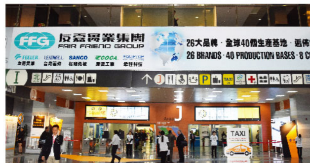
TIMTOS 2015 - Exhibition Center Advertising