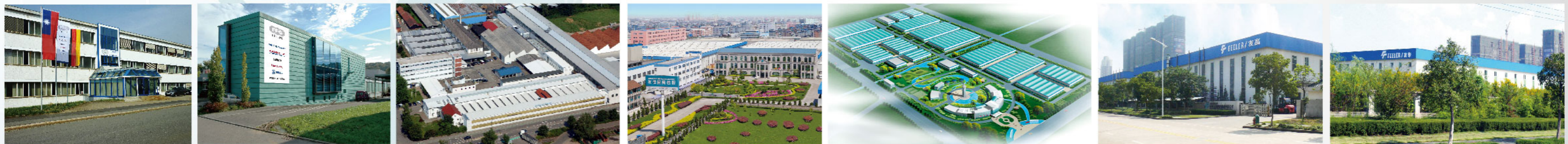
● Modul - Germany ● VDF Boehringer - Germany ● Witzig & Frank - Germany ● Hangzhou Good Friend – Hsiaoashan (66,000 m²) ● Hangzhou Good Friend – Jiangdong Technology Park (666,000 m²) ● Hangzhou Global Friend – Xiasha (59,400 m²) ● Hangzhou Ever Friend – Xiasha (82,500 m²)