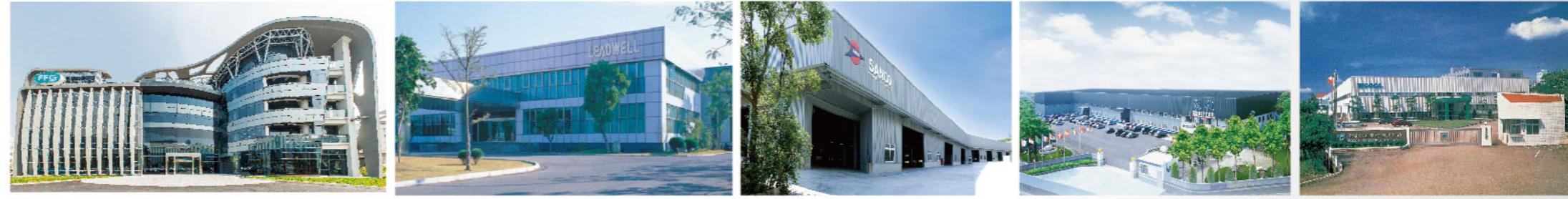
● Fair Friend – Nantun ● Leadwell – Taichung ● Sanco – Sanyi ● Equiptop - Taichung ● Ecoeca – Taichung