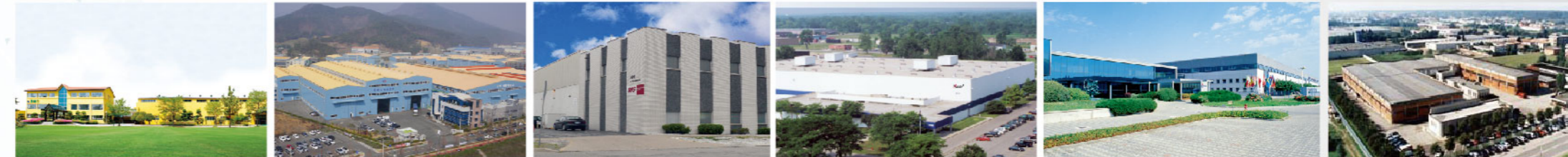
● FFG DMC - Korea ● DSK - Korea ● SMS – U.S.A. ● MAG PORT HURON - U.S.A. ● JOBS,Rambdaudi,Sachman,Sigma-Italy ● IMAS - Italy